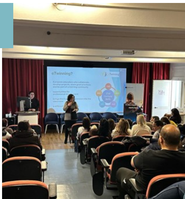
24th January - San Gwann Primary School learning about the opportunities of Erasmus+

EUPA was invited to deliver an Information Session at the San Gwann Primary School. During this intriguing gathering, EUPA provided attendees with an overview of Erasmus+ together with its benefits. Additionally, they were also given an overview of eTwinning. Attendees then had the chance to hear success stories from the EU school community as well as learn more about the opportunities of professional growth that Erasmus+ can provide for them. Whether you're a teacher, administrator, or support staff, there's something for everyone with Erasmus+.