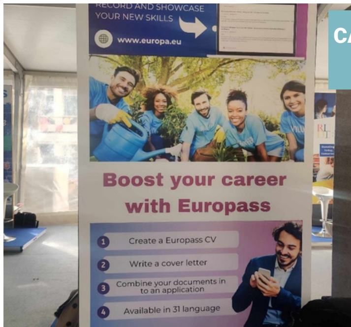
February Career Expo

During both the Junior College Career Expo (8th - 9th February) and the University of Malta KSU Career Expo (20th - 22nd February), EUPA was there to educate eager students about possible career opportunities as well as how they could best enhance their professional journey. While there, EUPA specifically highlighted the importance of Europass, a tool used to communicate skills, qualifications clearly all across Europe.