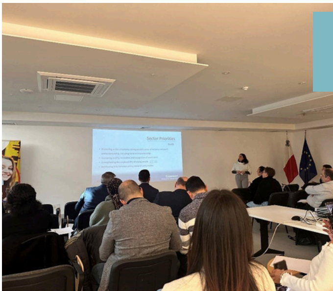
17th January - Key Action 2 Project Lab at EUPA Offices

On January 17th, EUPA organised an information session focusing on Key Action 2 projects. The educational discussions specifically focused on Cooperation Partnerships as well as Small-scale Partnerships. Key action 2 gives participating organisations the chance to gain experience in international cooperation while strengthening their capacities. During the session, an overview of the 2 types of partnerships was provided with a special focus on the funding mechanisms.