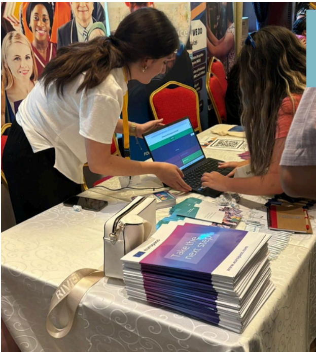
IChoose July 2024 - Connecting with students