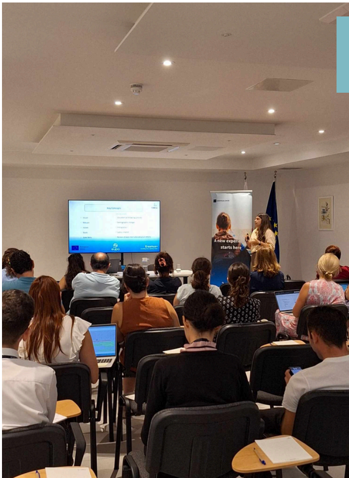
EUPA's Communication's Team giving feedback to prospective applicants