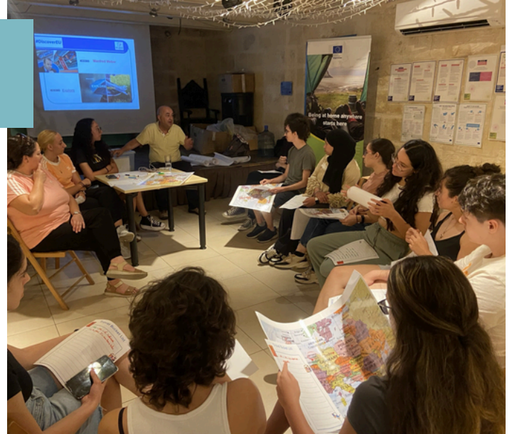
DiscoverEU Meeting - Preparations in full effect

During this meeting, Maltese 18 years old attended the pre-departure meeting held by EUPA's Youth team in anticipation of their upcoming DiscoverEU journey. Here, participants got a rundown of the trip's agenda and got the chance to raise any queries they might have had. Such a meeting also provided them with the opportunity to learn more about the importance of the DiscoverEU priorities, such as the exploration of Europe's cultural heritage and history.