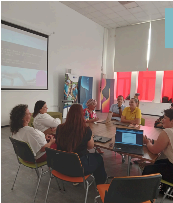
Youth professionals discussing '#Tech-tonic Motions in Learning'