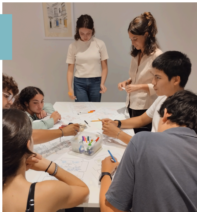
Youths sharing their experiences with each other

On the 20th September, EUPA's youth team organised a meetup for all past participants of the DiscoverEU programme. The ambassadors got the chance to share their various exciting stories with each other as they reconnected over shared experience. Additionally, during the meeting DiscoverEU's past participants got to see what other opportunities they can take part of under the Erasmus+ and the European Solidarity Corps programmes.