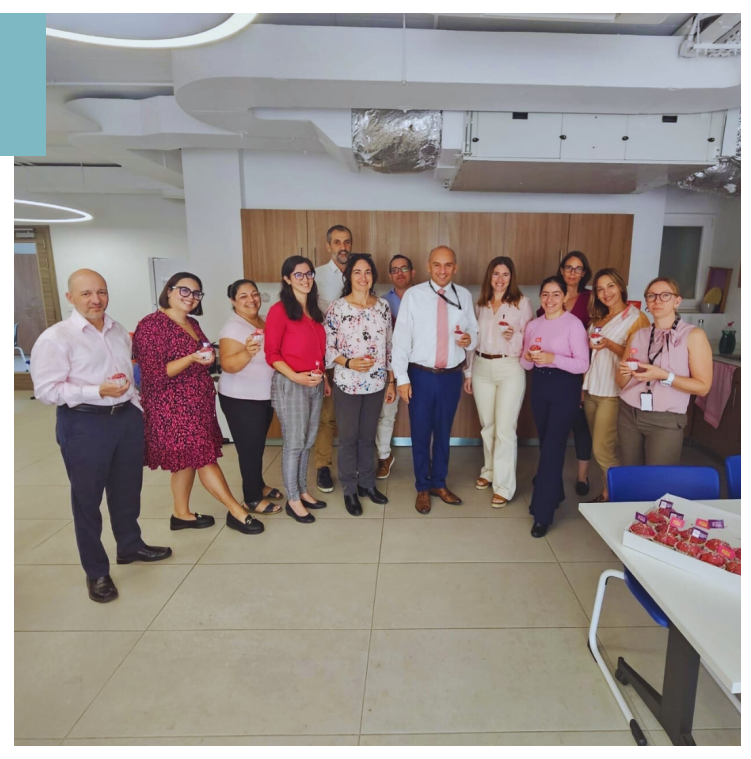
EUPA staff during Pink October

October and November are dedicated to raising awareness for vital health issues. Pink October focuses on breast cancer prevention, while Movember highlights men's health, including prostate and testicular cancer and suicide prevention. In support of these causes, EUPA staff came together to organise a series of fundraising activities, including fun quizzes. Their efforts raised €300, which was proudly donated to Puttinu Cares, helping patients and families in need. Together, we continue to raise awareness, foster important conversations, and contribute to our community.