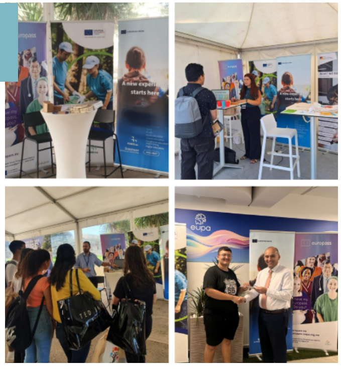
EUPA Communications Team connecting with students

EUPA participated in multiple freshers' week events across Malta and Gozo, visiting Junior College, the University of Malta, the Institute of Tourism Studies, Giovanni Curmi Higher Secondary, and the Malta College of Arts, Science and Technology. These events provided an excellent platform for students to discover the benefits of the Erasmus+, European Solidarity Corps, and Europass. Our goal is to inform as many people as possible about the incredible opportunities these initiatives offer, helping students broaden their horizons and enhance their personal and professional growth. Students who visited the EUPA stand had the opportunity to join a giveaway, with many walking away with fantastic prizes!