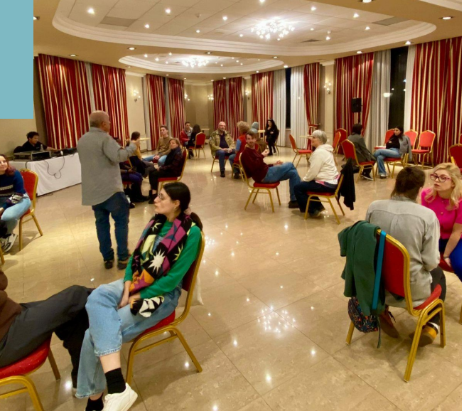
Participants connecting during interactive activities

Over the course of three impactful days, youth workers and experts met here in Malta for a study visit on 'Interfaith Dialogue and Youth Work'. Participants had the chance to engage in interfaith dialogue to promote understanding, peace, and inclusive communities. They also reflected on Malta's interfaith landscape together with local experts, drawing insights to apply in their own communities back home.