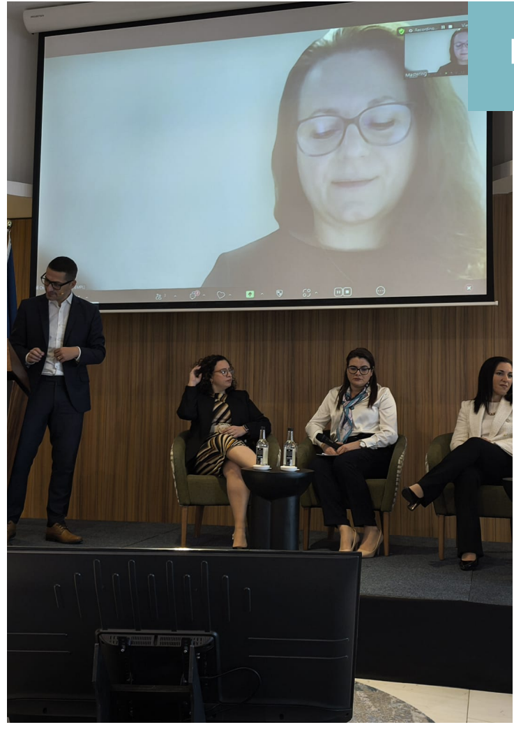
Europass Panel Discussion