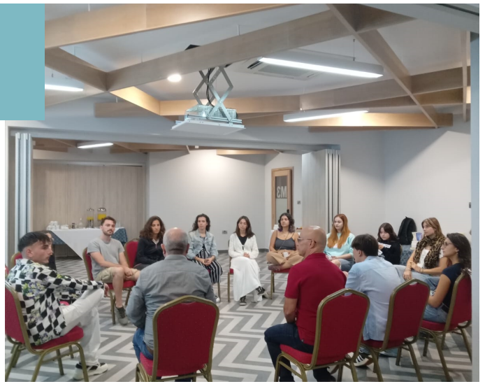
Excited volunteers during their on arrival training

From the 14th to the 17th of November, 13 young volunteers participated in their on-arrival training under the European Solidarity Corps programme. They came to Malta to support and volunteer at a variety of organisations in Malta. The training was designed to introduce them to the host country, equip them for their upcoming activities, and enhance their experience within the European Solidarity Corps framework.