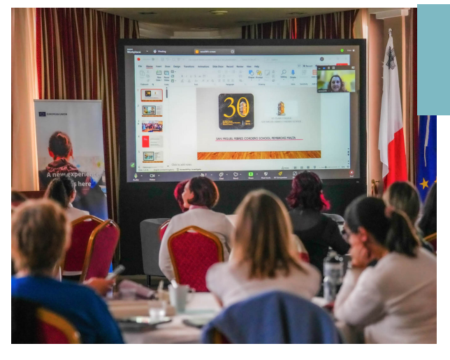
Participants coming together to discuss reaching people with fewer opportunities