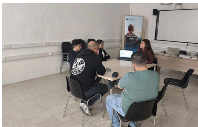
Representatives from organisations active in the field of disability during the DiscoverEU Inclusion Action Information Session

In an effort to continue promoting the DiscoverEU Inclusion Action, on 1 st February, EUPA organised an information session targeting organisations active in the field of disability to inform them about this scheme which gives young people with fewer opportunities the chance to explore Europe through short-term individual or group travel experiences by rail or other modes of transport where necessary.