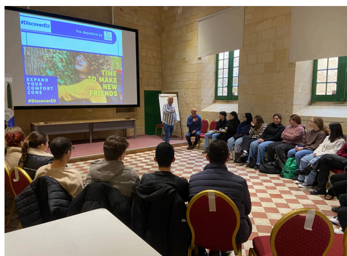
Participants during the DiscoverEU Pre-Departure Meeting

participation of 20 Maltese travel pass winners. During the meeting, EUPA staff, along with facilitators, provided all the necessary information regarding the booking procedure and offered valuable travelling tips to enhance the overall experience of the participants and help them plan their travel. Feedback received from the travellers revealed that the meeting served as an excellent opportunity to get well-acquainted with the details that make the journey smoother. This meeting was not just about information... it was also about building connections. We encouraged travellers to attend not only to gather essential information but also to meet fellow travellers. Whether traveling alone and looking for a travel companion to join, the meeting offered the chance to find someone who shares their interests and can make the journey even more remarkable.