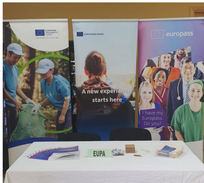
Our stand at Giovanni Curmi Higher Secondary School, Naxxar

EUPA also took the opportunity to spread the word about the benefits of Europass for those looking to apply for a job.