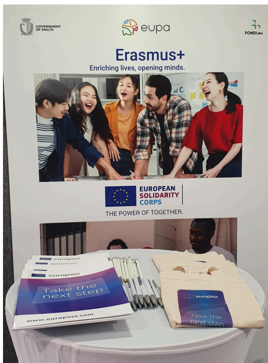
Our stand at KSU Career Expo

EUPA also informed about the tools available as part of the Europass network, including the CV and cover letter editor.