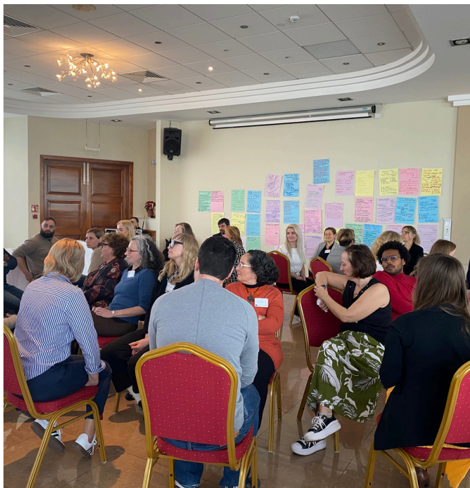
Participants during one of the activities held during the TCA