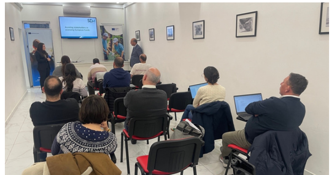
During the information session in Gozo

On 14 th March, EUPA organised 2 information sessions in Gozo in collaboration with Servizzi Ewropej f'Malta (SEM). One of these sessions focused on familiarising Gozitan organisations with Erasmus+ and European Solidarity Corps, while the other session focused on how to write a successful project proposal.