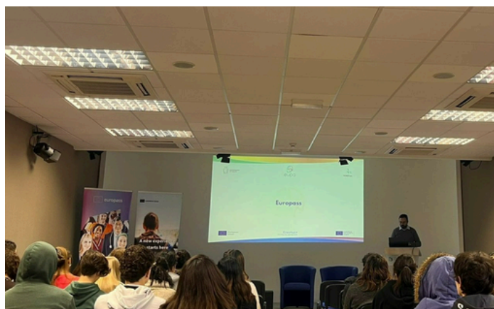
During one of the talks delivered during Junior College Career Expo

On 16 th and 17 th January, EUPA participated in the Junior College Career Expo with the aim of informing students about opportunities available for them under Erasmus+ and European Solidarity Corps. and how these opportunities can boost their employability skills. Besides setting up an information stand, EUPA also delivered two talks, one about EU funding opportunities for youth and another focusing on Europass and how the Europass platform and its tools is a one stop shop for new job seekers.