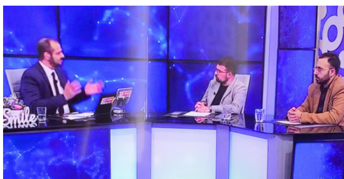
During the media intervention on F Living TV

On 26 th March, EUPA participated in a media intervention on F living TV Channel, along with Servizzi Ewropej f'Malta. During this media intervention, EUPA focused on Erasmus+ and European Solidarity Corps funding opportunities for Maltese organisations.