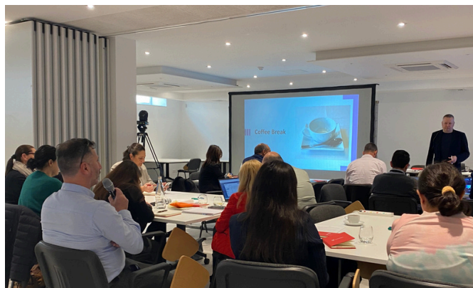
Experts during the training

On 27 th March, EUPA held an assessors' training session. Such initiatives form part of our ongoing efforts to ensure that our experts are fully equipped with the right tools and insights in order to ensure high-quality evaluation of Erasmus+ and European Solidarity Corps projects. The training focused on strengthening assessment standards, consistency, and transparency throughout the evaluation process.