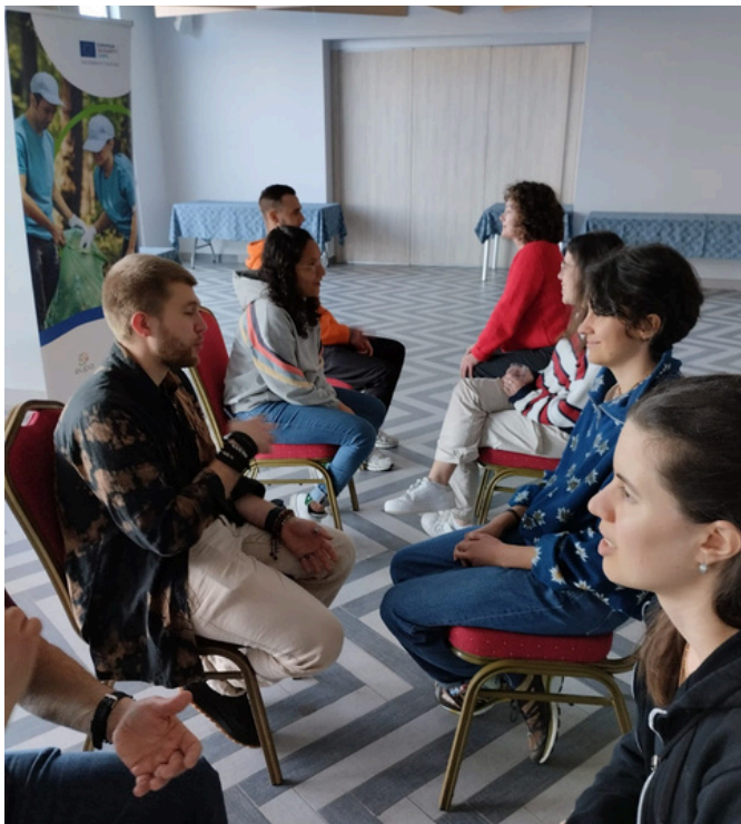
Participants during one of the activities held as part of the training

Solidarity Corps programme. This training also helped them connect with others, learn about the country and the organisations they're involved with.