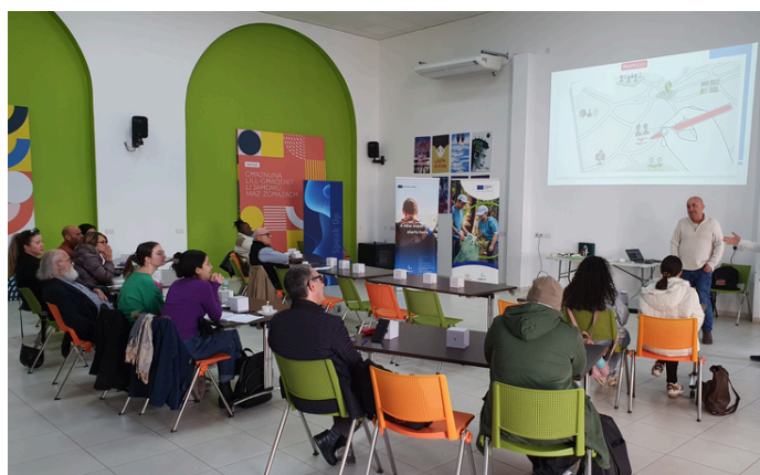
Participants during the Youth Pass Seminar

To explore the opportunities that this process provides, EUPA invited those who were responsible for coordinating the YouthPass process in beneficiary organisations active in the Erasmus+ and European Solidarity Corps programmes to attend this seminar, where the potential of using YouthPass as a tool for recognition of non-formal and informal learning holds was explored in greater detail.