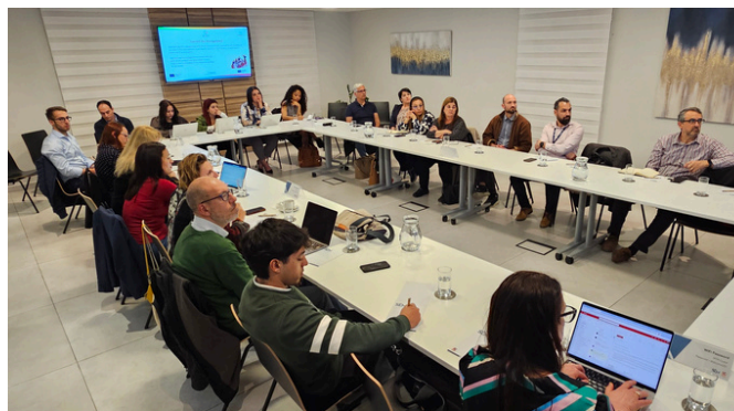
During the information session in Malta

Similar to the information sessions held in Gozo, on 24 th March, EUPA organised 2 information sessions in Malta in collaboration with Servizzi Ewropej f'Malta (SEM). The first sessions focused on Erasmus+ and European Solidarity Corps funding opportunities for Maltese organisations, while the second session focused writing a successful project proposal.