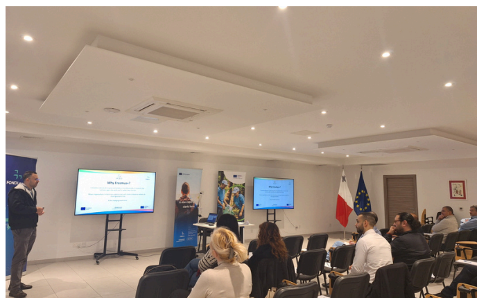
Participants during one of the sessions

In order to prepare for the upcoming Key Action 2 deadline in March, on 31 st January, EUPA organised From Concept to Collaboration, Starting Strong with Key Action 2, a workshop aimed at Key Action 2 applicants to help them develop a strong proposal.