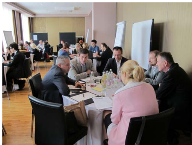
Meeting of the Danube programme and EUSDR PACs, Ljubljana, Slovenia

The linkages between the new Danube Programme and the EUSDR were also discussed among the key stakeholders, eg at the Danube Programme TF meeting (21 May, Ljubljana, Slovenia), where INTERACT could build a bridge and open dialogue of the two different governance systems.