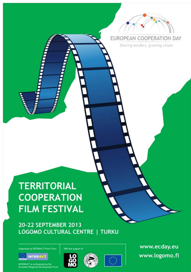
Poster of the Territorial Cooperation Film Festival held in Turku, Finland

The evaluation of the 2013 campaign also commenced; the first meeting took place on 20 November in Amsterdam.