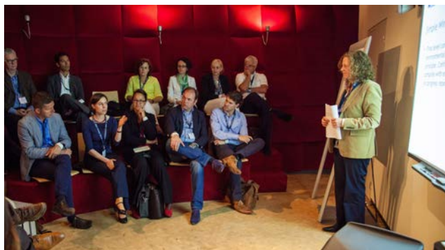
HIT promotion meeting, June, Utrecht, Netherlands

Based on the initiative transnational programmes, a separate HIT package was developed taking into account their needs. The work started with a workshop with the participation of transnational programmes and INTERREG IVC (13-14 March, Copenhagen), to be followed by 3 other meetings and by the end of the year, all tools were reviewed. Eventually, besides INTERREG IVC, 9 transnational programmes participated in the working group. After investigating the needs, a CBC working group was also established, which had its first meeting on 11-12 December in Prague and by the end of the year, an IPA CBC working group was also under preparation.