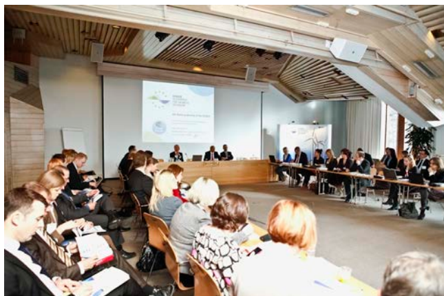
4th Working Meeting of the EUSBSR, 10-11 April, Espoo, Finland

INTERACT organised or provided assistance to many other events, among them the 4th Annual Forum of the EUSBSR (11-12 November, Vilnius, Lithuania), 2 EUSBSR information days (19 June, Riga, Latvia and 20 June, Vilnius, Lithuania), moreover advisory services and meetings focusing on the EUSBSR governance system.