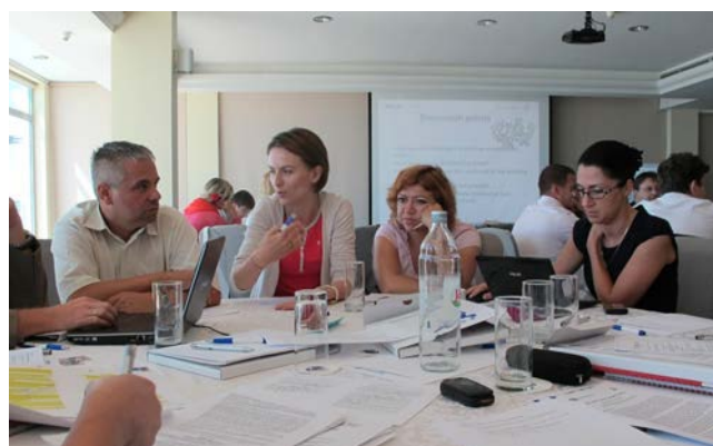
Annual meeting of the IP Vienna regional network, 4-5 September, Dubrovnik, Croatia