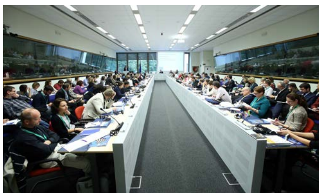
SME workshop during the Open Days, 9 October, Brussels, Belgium

lectual Property Rights, Revenues and State Aid (10-11 April, Luxembourg). Certain solutions were presented and discussed (eg Financial Engineering Instruments). The results of the event, as well as the results of a EU-wide survey on SME involvement, together with workable solutions were summarised in a study published in September. It was used as a basis for a workshop, organised together with the Commission during the Open Days (Involvement of SMEs in ETC: How to deal with State Aid and intellectual property rights in the context of ETC programmes?), which attracted more than 300 participants.