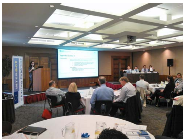
4 th Annual Meeting of AAs and members of GoA, 15-16 May, Ireland

Annual control reports, sampling methods, irregularities, payment interruptions and audit authority roles for the future programming period were addressed during the 4th Annual Meeting of ETC Audit Authorities and Members of Group of Auditors , which took place on 15-16 May in Castleknock, Ireland.