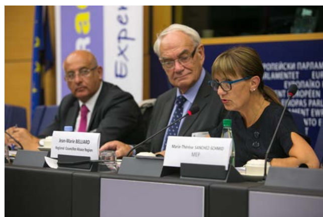
EC Day 2013 opening event, 10 September, Strasbourg, France

Following extensive preparatory work that - besides the organisational part - included updating the dedicated website, producing visual identity several video clips, EC Day 2013 activities were launched on 10 September. The opening event consisted of a Conference at the European Parliament in Strasbourg under the auspices of MEP Sanchez-Schmid, where also EC Director Palma Andrés and other representatives of the CoR and the Alsace Region participated. A video message of Commissioner Hahn was presented as well. It was followed by a photo exhibition of ETC flagship stories from all over Europe ('Achievements of European Territorial Cooperation'), also at the European Parliament with the presence of project stakeholders. During the exhibition, the 5 ETC (and ENPI) project videos prepared for EC Day were also shown. Besides, a mobile application for EC Day was put online and used by stakeholders all over the EU and beyond to animate the communication campaign.