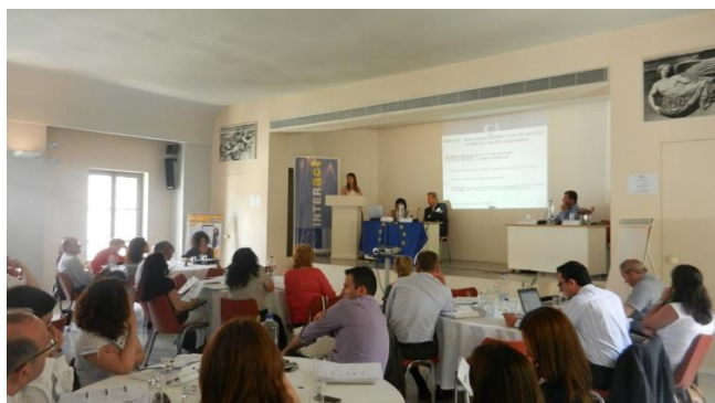
5th Meeting of ETC AAs and members of GoA, 11-12 June, Athens

The AAs network was maintained all along the year, including the preparation and follow-up of the event itself.