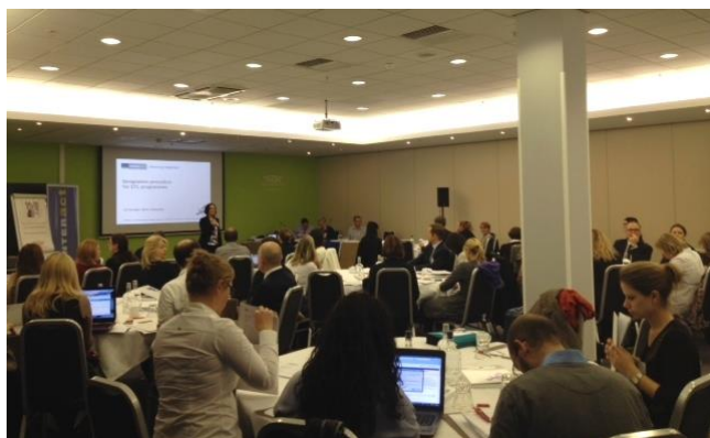
Designation procedure for ETC programmes event, 22 October, Brussels