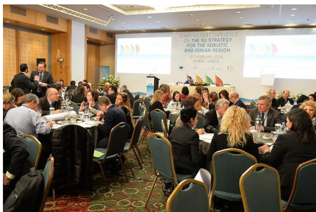
EUSAIR stakeholder conference, 6-7 February, Athens