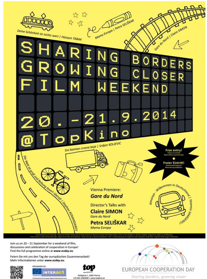
EC Day Film Weekend poster (Vienna)