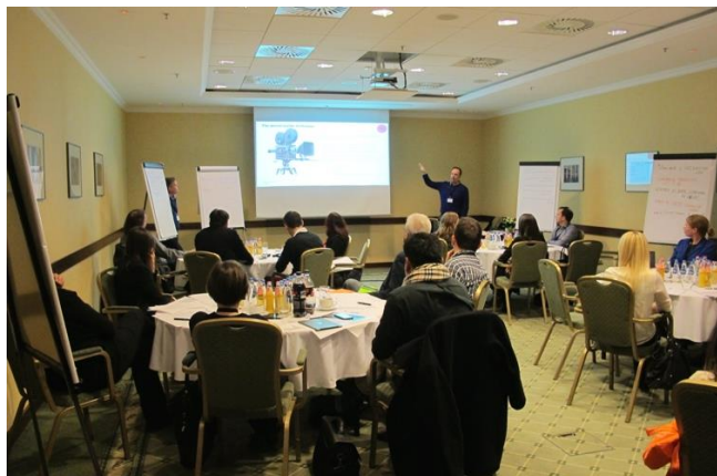
Storytelling through writing event, 27-28 November, Warsaw

This workshop combined the ‘Story telling workshop’ and the ‘Storytelling workshop for stakeholders of Macro-Regional Strategies’ (work package F/40) events, which planned as separate activities in the JAWP.