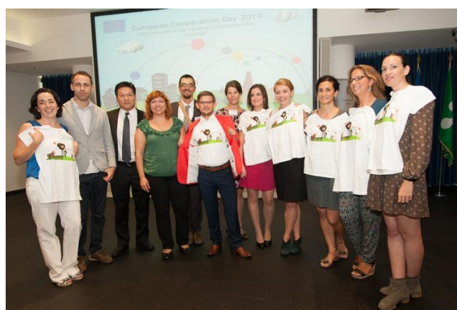
EC Day 2014 kick-off event, 16 September, Milan