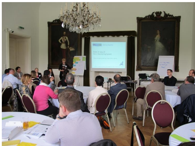
eMS observers group meeting, 9 April, Vienna

templates, where necessary further developed and/or adapted. The development was continuously supported/supervised by INTERACT and the ETC programmes that are member of the core developers group were regularly involved and invited to meet during the process. Other interested programmes were also given regular updates on the system during the observers group meetings. Information about the system is available in the form of different supporting documents, Q&As, and on the online platform.