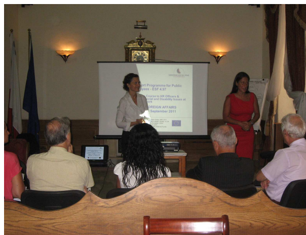
Photo: Training for Human Resource Managers