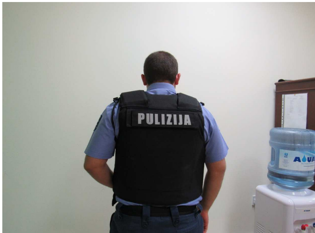
Bullet Proof Vests