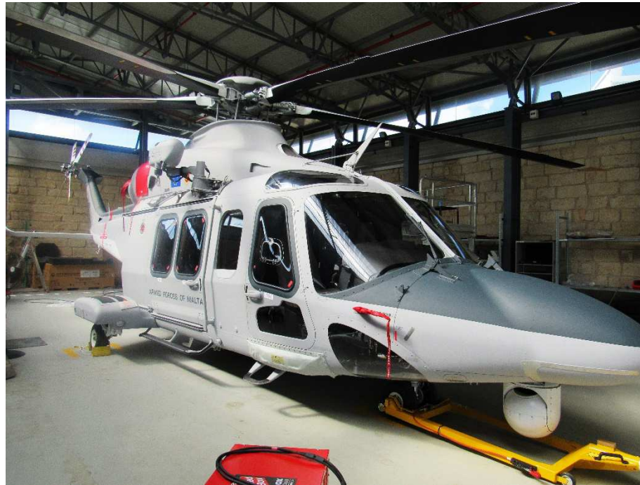
Third Twin Engine Helicopter