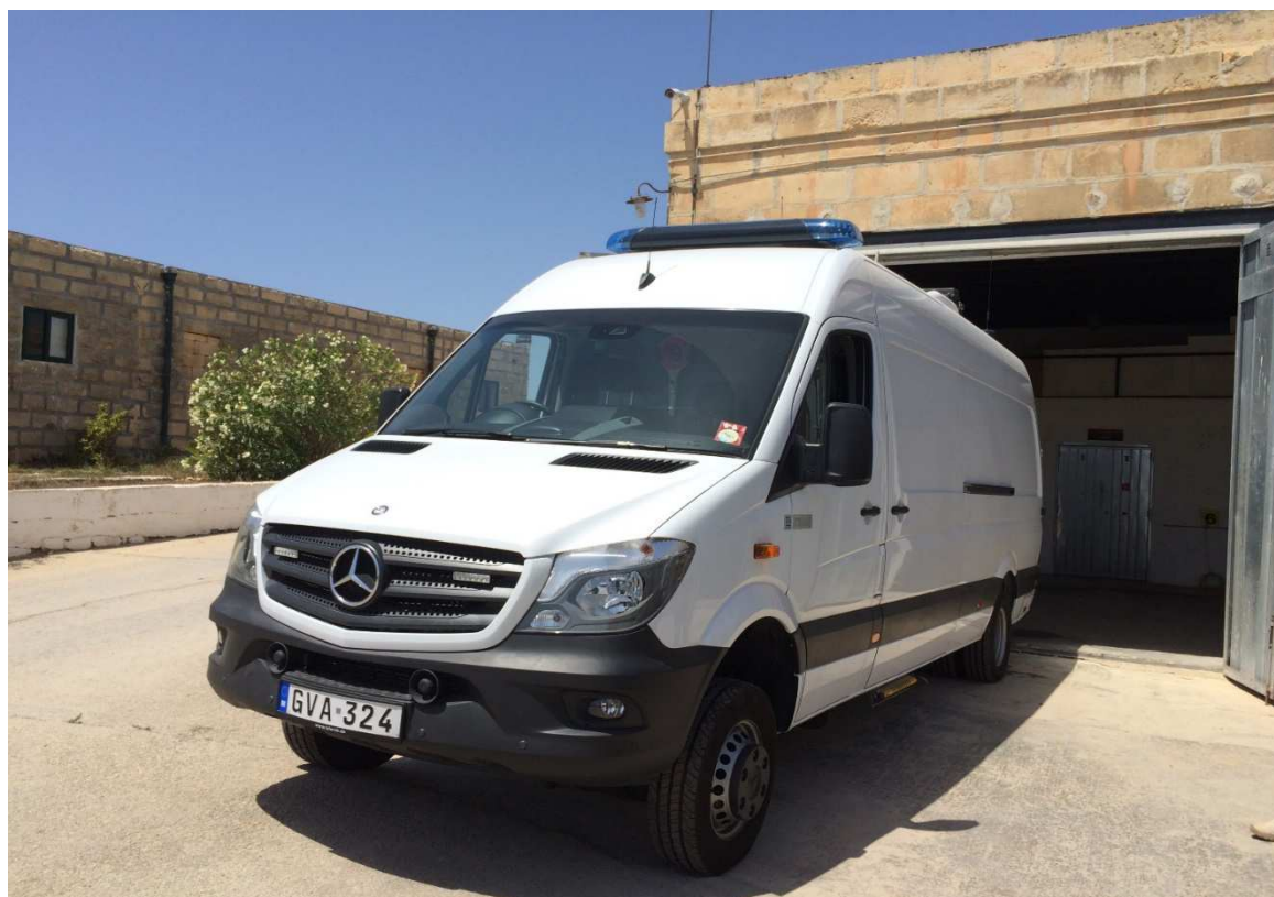
EOD Response Vehicle