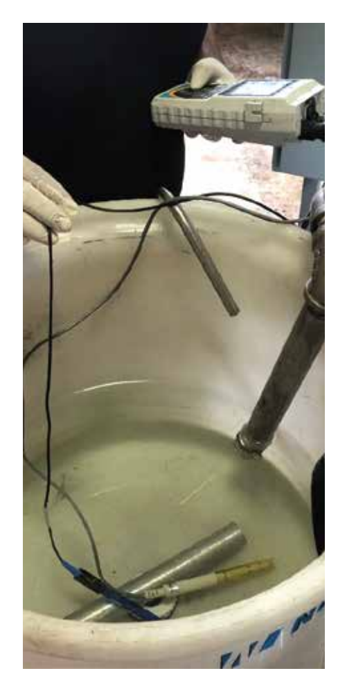
Figure 5. Measuring the conductivity of the permeate