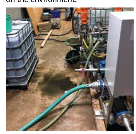
Figure 2. Proof of concept installation on a local pig farm.

This pilot project is a follow-up from a 'proof of concept' project funded by GAB (Governance of Agricultural Bio-resources) and carried out in 2018 when pig and cow slurry was treated successfully to recover water, fibres and organic concentrate. SYNECO enhances the feasibility of the proposed solution and will test the recovered products in the laboratory and on the field to assess soil and plant performance as well as to monitor whether these recovered products will have an adverse effect on the environment.