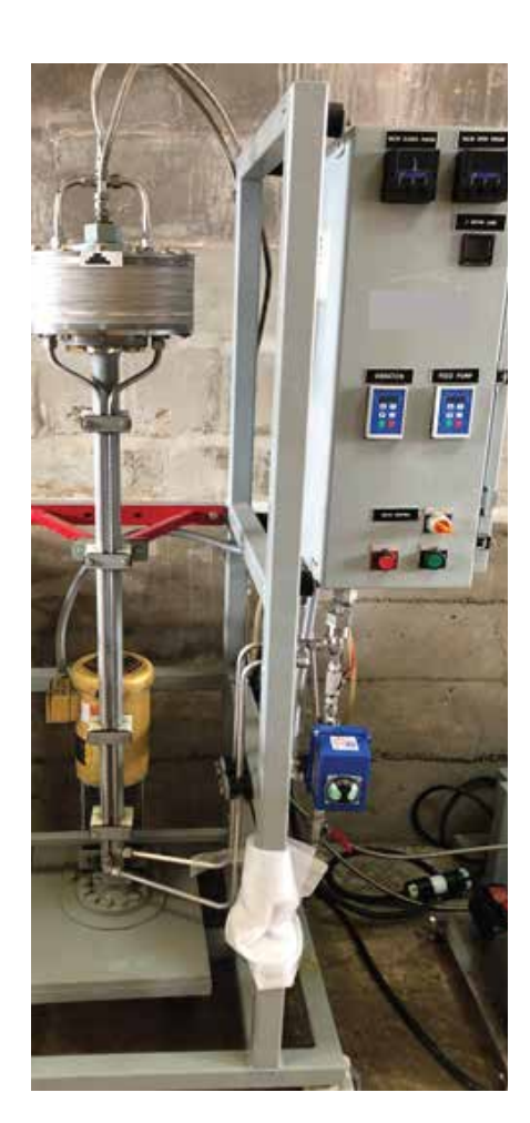
Figure 3. Detail of vibrating RO for the single pass treatment of raw slurry

This project is in line with the objectives of the FCCS as it aims to enhance the quality of the agricultural produce that its members cultivate as well as to enhance the technical skills of the farmers in the application and management of fertilizer.