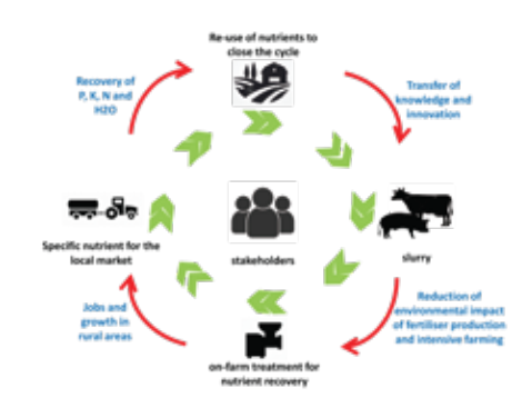
Figure 1. SYNECO. A circular economy approach.

of pig and cow slurry. The project specifically deals with the treatment of cow and pig manure and recovers this resource into biofertilizer for use in agriculture in accordance with best agricultural practice - including crop and fertilizer plans. The project is a 20-month project and will be carried out in close collaboration with the cow (Koperattiva Produtturi tal-Halib) and pig (Koperattiva ta' min Irabbi I-Majjal) cooperatives. SYNECO will alleviate the challenges that these cow and pig breeders face today when it comes to the management of the slurry that their farms generate.