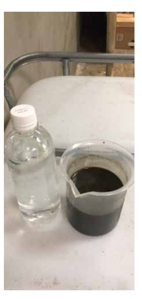
Figure 4. Raw slurry before (dark) and after (clear) a single pass through the vibrating RO pass