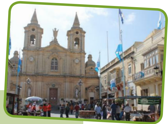
Festa tal-hut, Żurrieq