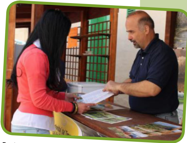
Festa tal-halib, Gharghur

For these events, the Managing Authority set up a stand to promote Rural Development activities. The general public was the target audience of these promotional activities, enabling more awareness on the opportunities and achievement of the RDP 2007-2013 funds.