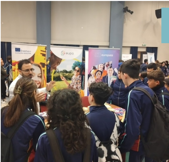
EUPA STAND AT THE CAREERS FAIR ORGANISED BY ST IGNATIUS COLLEGE

The IChoose Fair held in January / February 2023 at the MFCC was an inspiring event that brought together secondary school students to explore diverse career options. The event showcased various professions and allowed students to explore their skills, qualifications, and opportunities. Professionals from various sectors shared their experiences, providing valuable insights into their respective fields. The fair also promoted Erasmus programs, which offer European students the chance to study, work, or train in another European country. The Europass, a standardised European framework, was also promoted, enhancing mobility and employability. The fair empowered the next generation to make informed decisions about their future by fostering curiosity, facilitating interaction with professionals, and encouraging self-reflection.