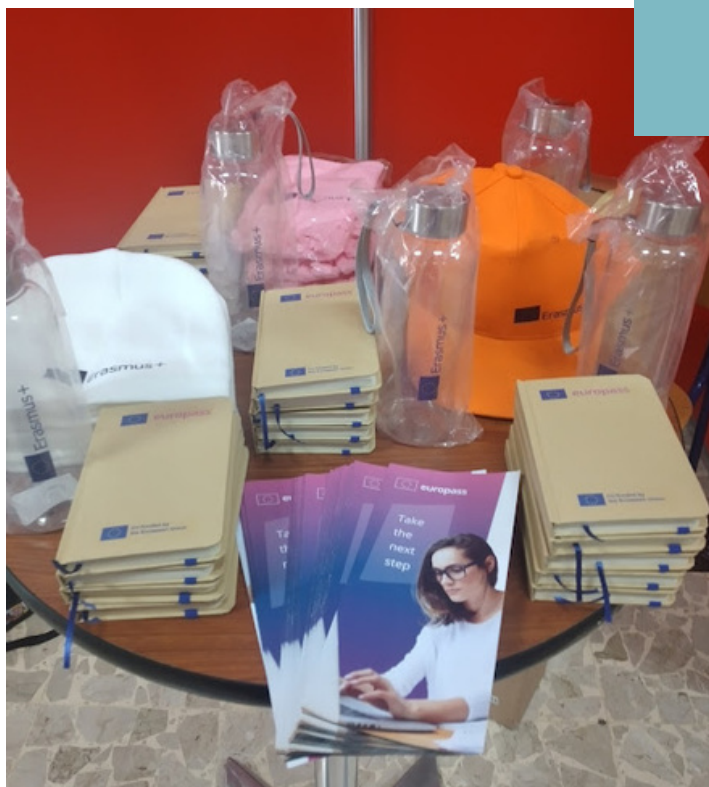
EUPA STAND AT THE UOM CAREERS FAIR

The KSU within the University of Malta organised the Career Fair for university students, a successful event that brought together young minds and potential employers. The event showcased companies and organisations from various industries, attracting students from various fields of study. Students had the opportunity to interact with representatives of these organizations, gaining insight into their respective industries and potential career paths. The highlight of the event was on-site interview sessions, where students could demonstrate their skills and passion to prospective employers. EUPA was a prominent participant, promoting European opportunities like Erasmus, Solidarity Corps, and Europass.