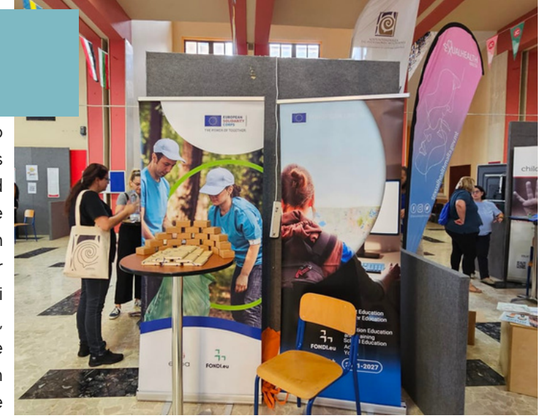
Freshers Week 2023 at Junior College, University of Malta, MCAST, Giovanni Curmi Higher Secondary, and the Institute of Tourism Studies

Over the next few weeks, EUPA is gearing up to participate in Freshers' Week across multiple campuses and educational institutions throughout Malta to spread awareness about the invaluable Erasmus+ Programme and the impactful European Solidarity Corps (ESC). With exciting events lined up, including engagements at Junior College, University of Malta, MCAST, Giovanni Curmi Higher Secondary, and the Institute of Tourism Studies, EUPA aims to connect with vibrant new faces, share valuable insights, and foster a dynamic community within the educational sphere. The Europass tool, a resource empowering individuals to showcase their skills and qualifications within a broader European framework will also be promoted. It's an opportunity to engage, inspire, and build lasting connections among the next generation of leaders and innovators in Malta's academic landscape.