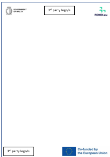
Figure 5: General examples of logo and EU emblem positioning