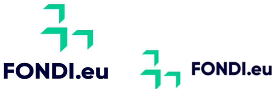
Figure 1: Vertical and Horizontal primary FONDI.eu logo

In addition, the period 2021-2027 is indicative of the duration of the programming period we have now entered – a seven-year period whereby EU-funded investments will be directed towards a number of key areas in line with Malta's priorities as well as the Union's targets.