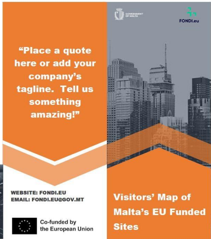
Figure 11 – Template Example of 3-gate leaflet / brochure

With regards to published material such as books, studies, official reports etc. exceptions to the layout may apply depending on the overall design. Therefore, while all required logos need to feature, their positioning can be adjusted to reflect the intended design. It is advisable that in these cases, a draft of the publication cover is sent to the Communications Unit on communications.eufunds@gov.mt for review.