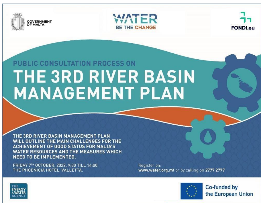
Figure 8: Example of Printed Plaque

The Managing Authority recommends that for optional plaques the same specifications as held above should be kept throughout to keep conformity and for easy association by the general public.