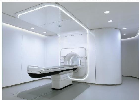
MR LINAC FOR THE RADIOTHERAPY DEPARTMENT SIR ANTHONY MAMO ONCOLOGY CENTRE