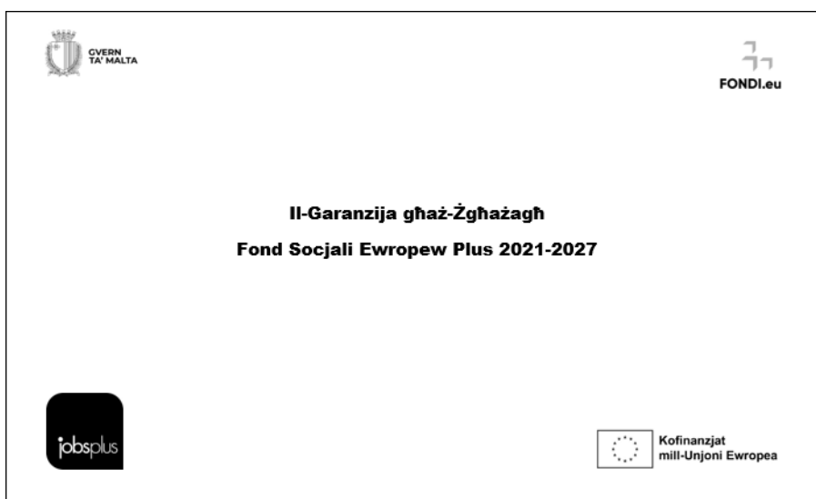
Figure 7: Example of Engraved Plaque Layout