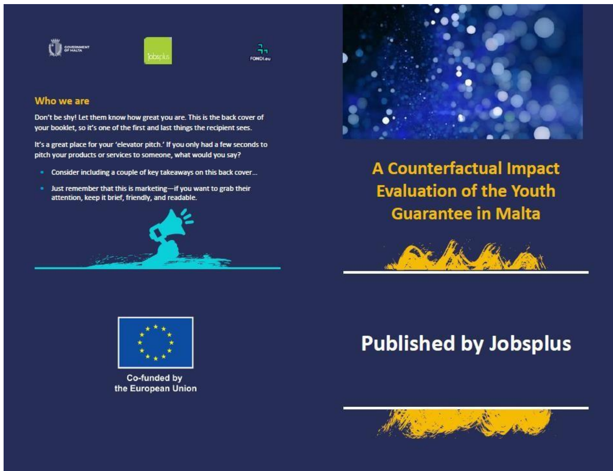
Figure 12: Example of Publication Cover.