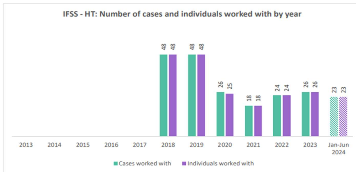
Figure 43: The figure above provides the number of cases worked with and the number of individuals worked with. To demonstrate the difference, consider Person A, who started and stopped attending a service twice in the same year, making it equivalent to 2 cases, but 1 individual worked with. In Jan-Jun 2024, 23 cases and 23 individuals were worked with compared to 26 and 26 respectively in 2023.

Service started reporting data in 2018. The service started using an online data collection system in 2020.