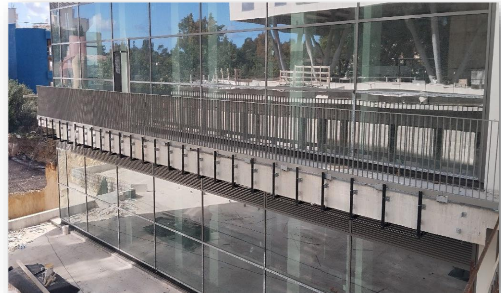
Zone D: Balconies railing at level 1