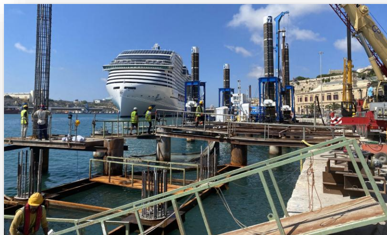
Ongoing works on site

Meetings are being held with the contractor to update the programme of works. The completion date of this project is planned for October 2026.