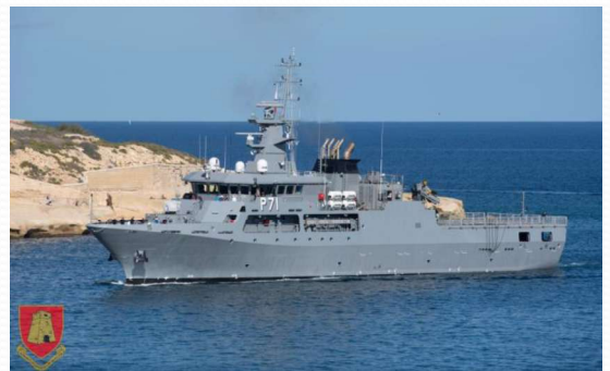
1 Offshore Patrol Vessel