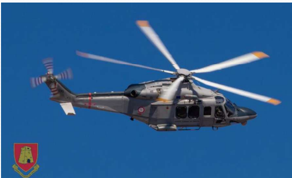
3 SAR helicopters