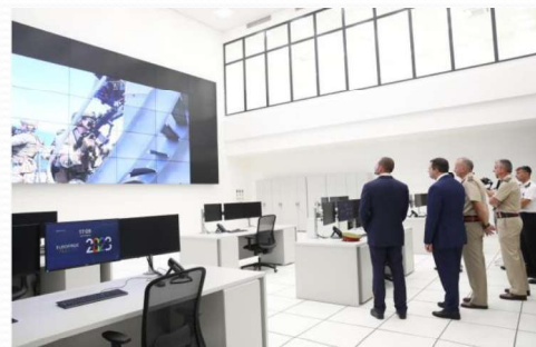
New Joint Operations Centre