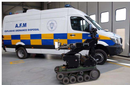
EOD robot with equipment