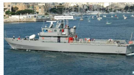
OPV P61 midlife upgrade