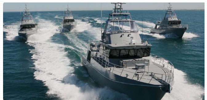
4 Inshore Patrol Craft