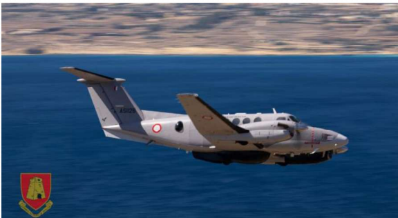
3 Maritime Patrol Aircraft