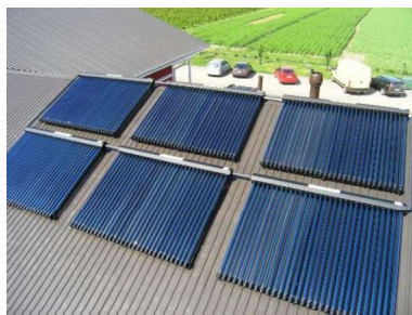
ERDF- Towards carbon efficiency within AFM Buildings