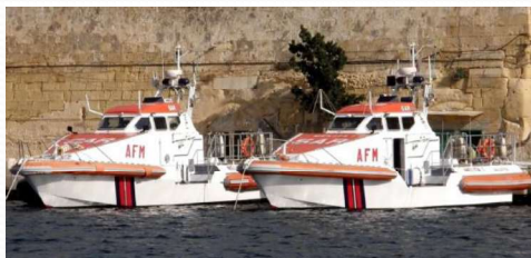
SAR launches midlife upgrade